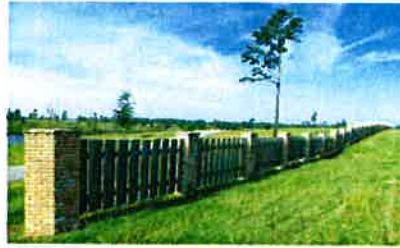
The Village is a gated community within Phase III. Small lots suitable for patio homes. Lots on lake and lots across street from lake. See lots 111-136.