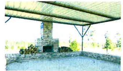
Owners of lots in Phase III may use the pavilion and play area for parties and reunions. (10 acres of green space.)