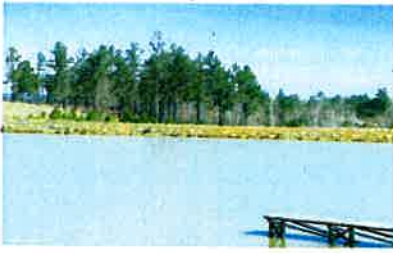
Owners of lots in Phase III can fish off levee of lake in Phase III.