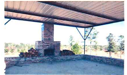
Owners of lots in Phase III may use the pavilion and play area for parties and