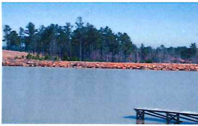
Owners of lots in Phase III can fish off levee of lake in Phase III.