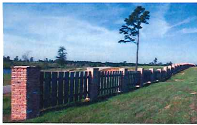
The Village is a gated community within Phase III. Small lots suitable for patio homes. Lots on lake and