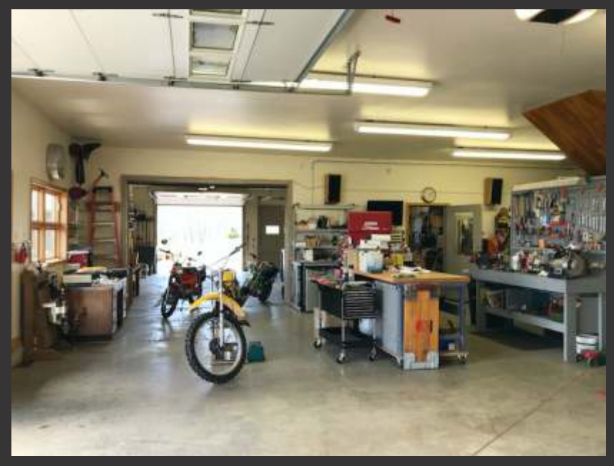
8 KINGSLEY RD. PINE VALLEY NY 14872