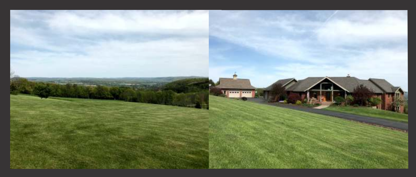
8 KINGSLEY RD. PINE VALLEY NY 14872