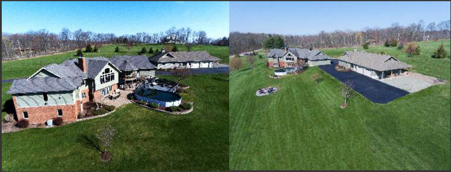
8 KINGSLEY RD. PINE VALLEY NY 14872