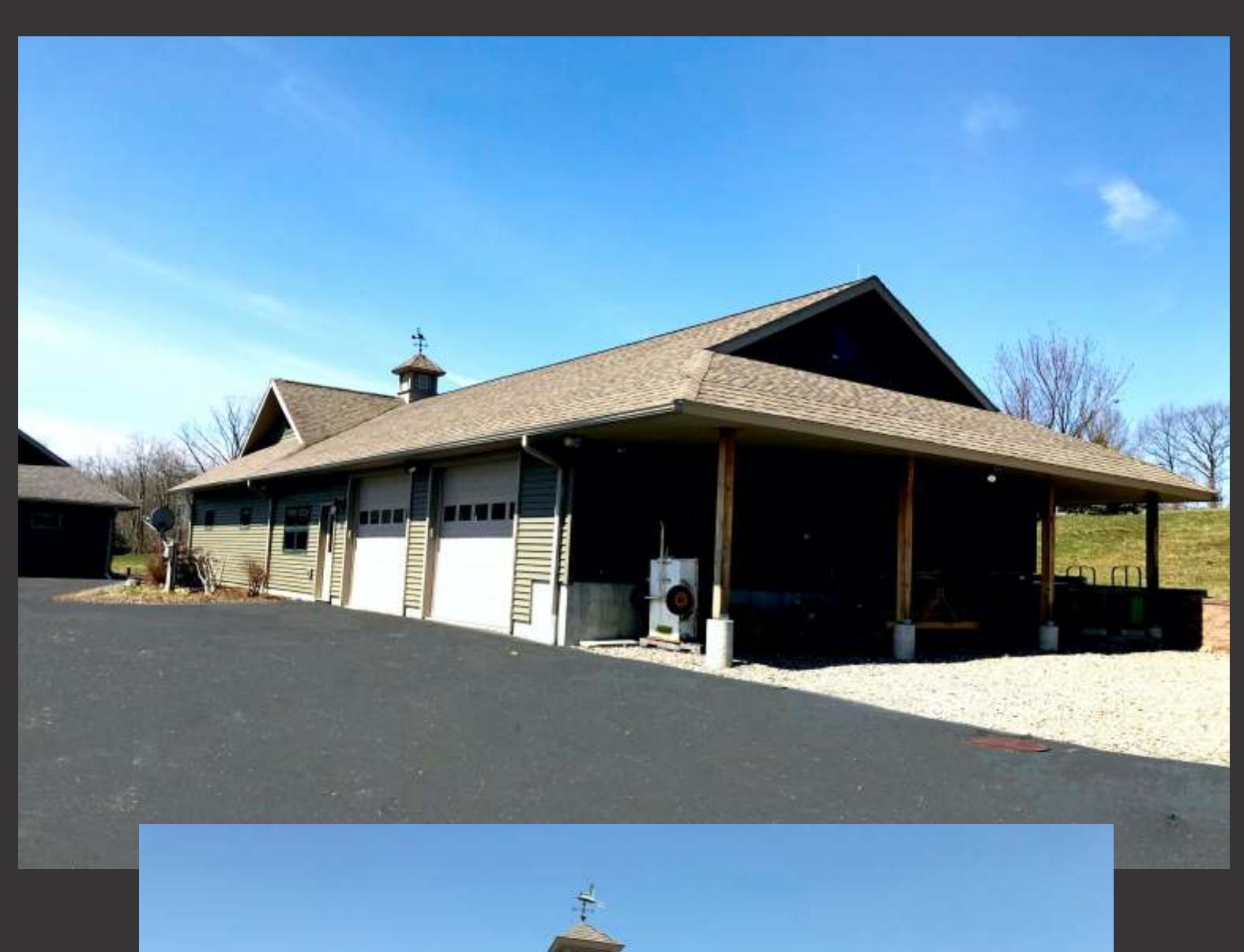
8 KINGSLEY RD. PINE VALLEY NY 14872