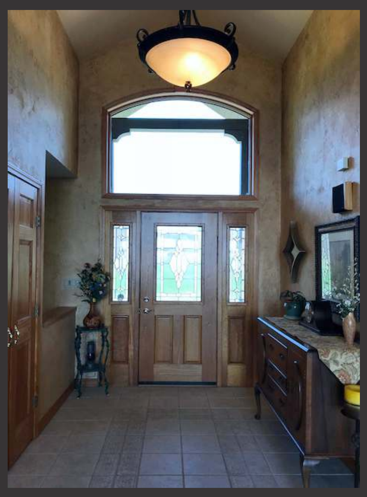
From the moment you step through the doors you feel the elegance and the warmth of this beautiful home.