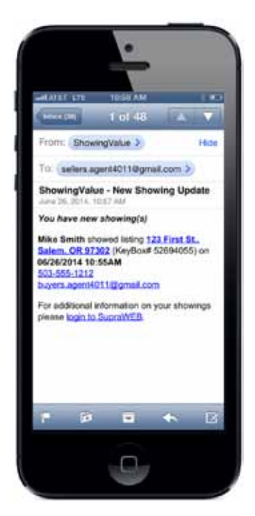
Agents win with Supra's real-time information!

800-547-0252 www.supraekey.com facebook.com/SupraRealEstate