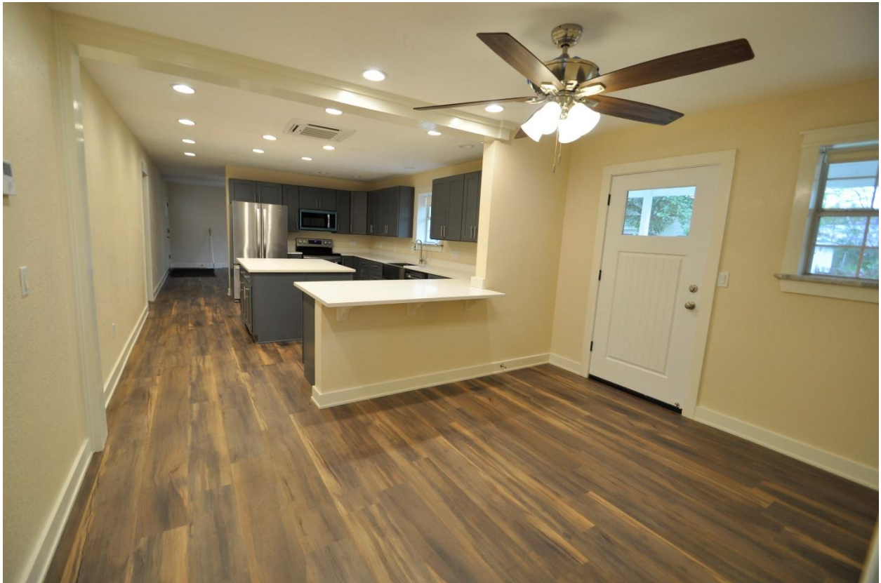
Dining area looking towards back door and kitchen