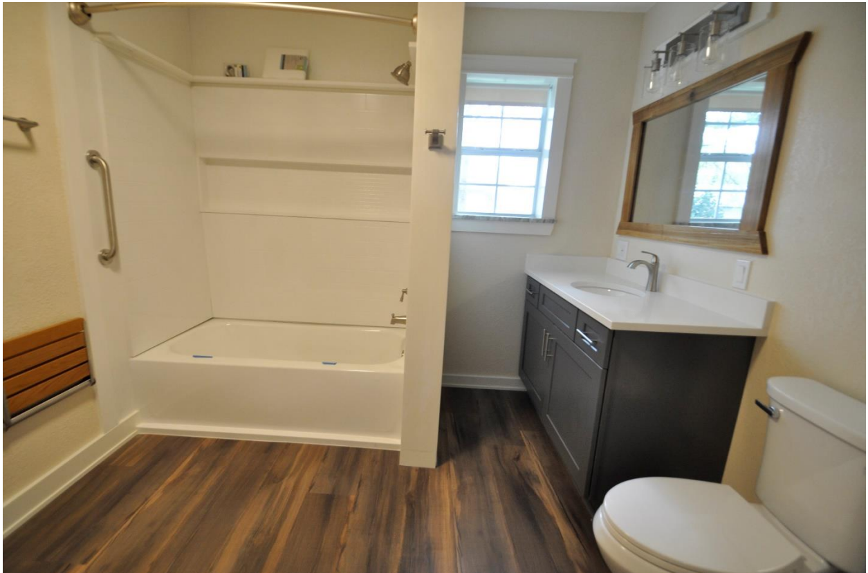
Hallway bathroom (laundry hook-ups in this room)