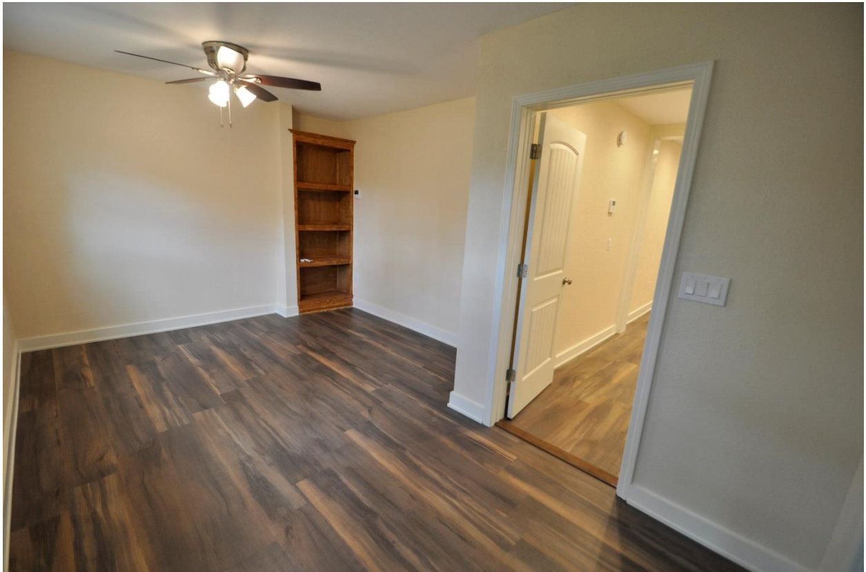
Back bedroom with built in shelf