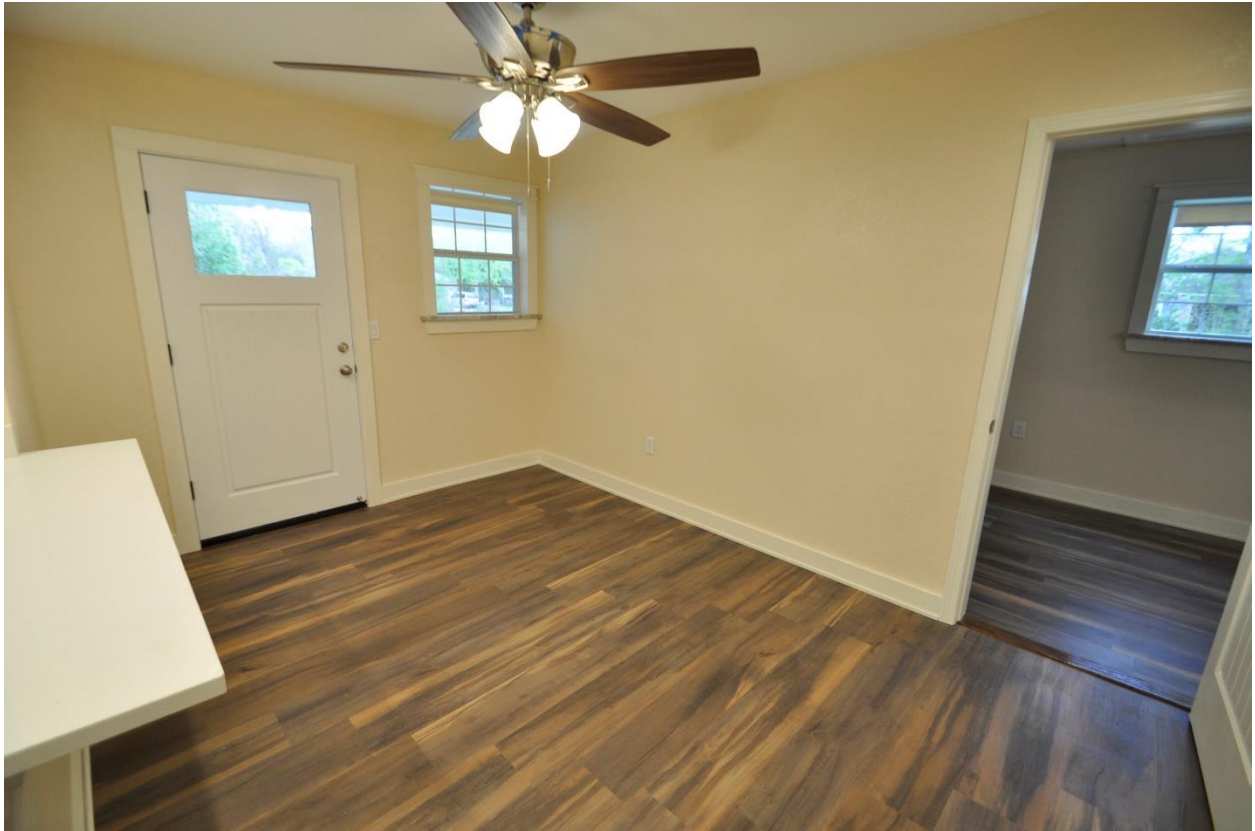
Dining towards back bedroom