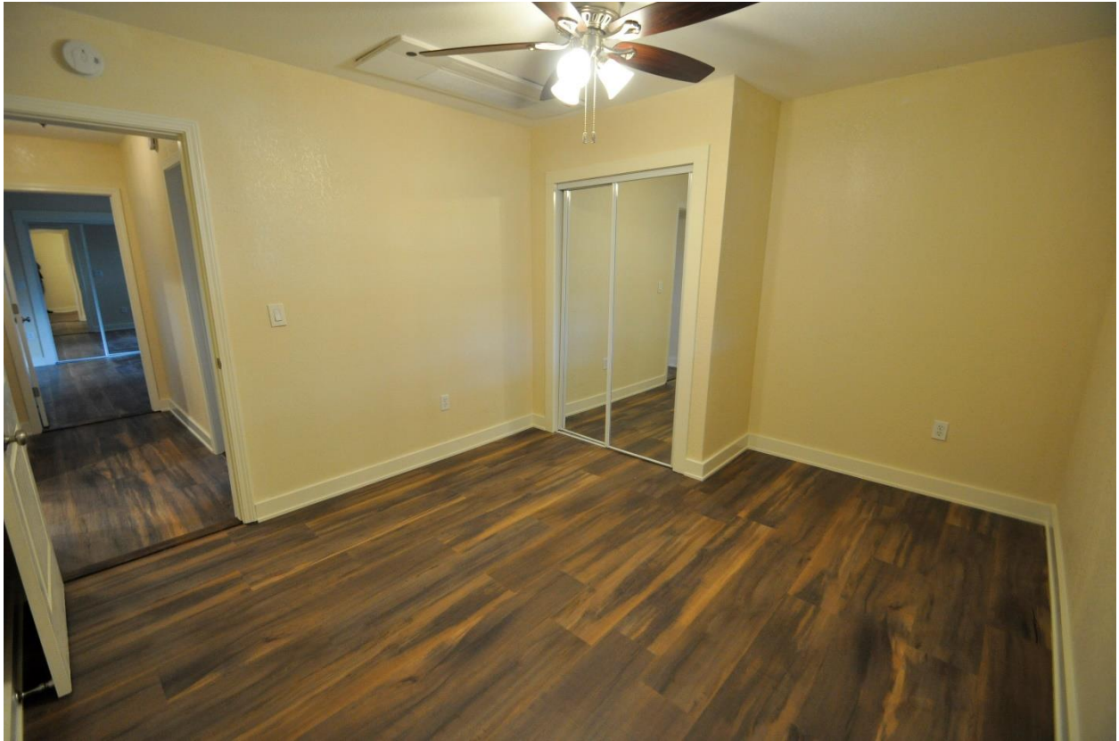
Front bedroom 2