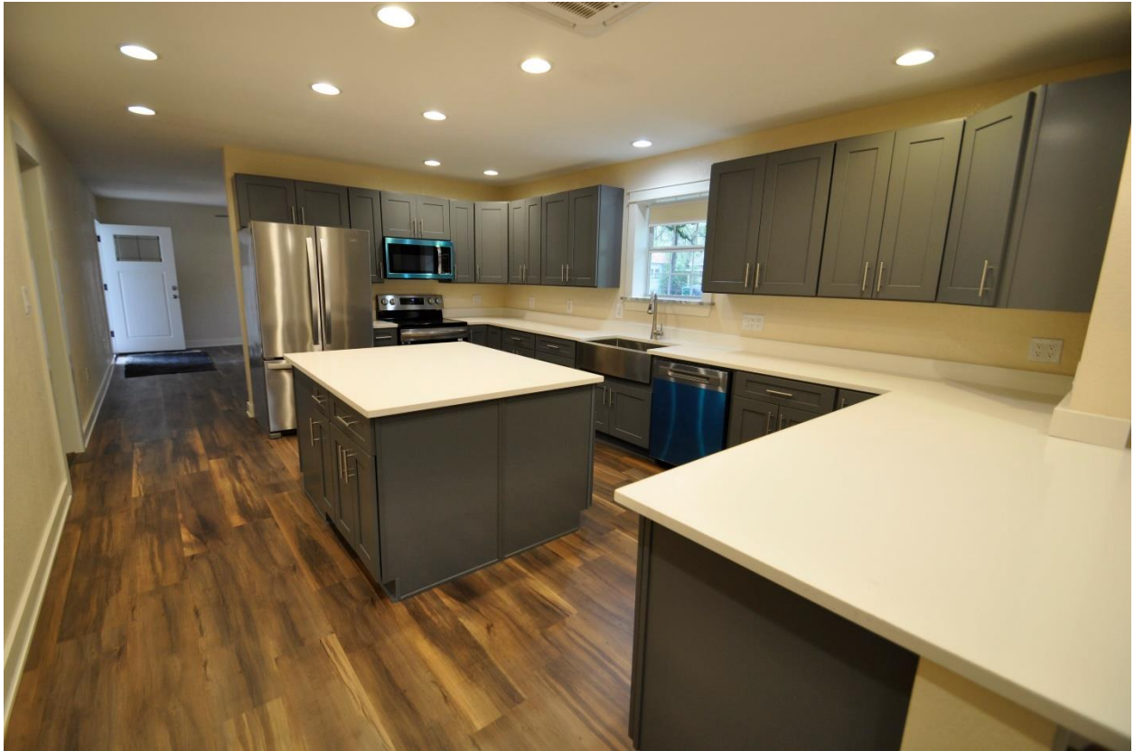
Kitchen (Refrigerator not included)