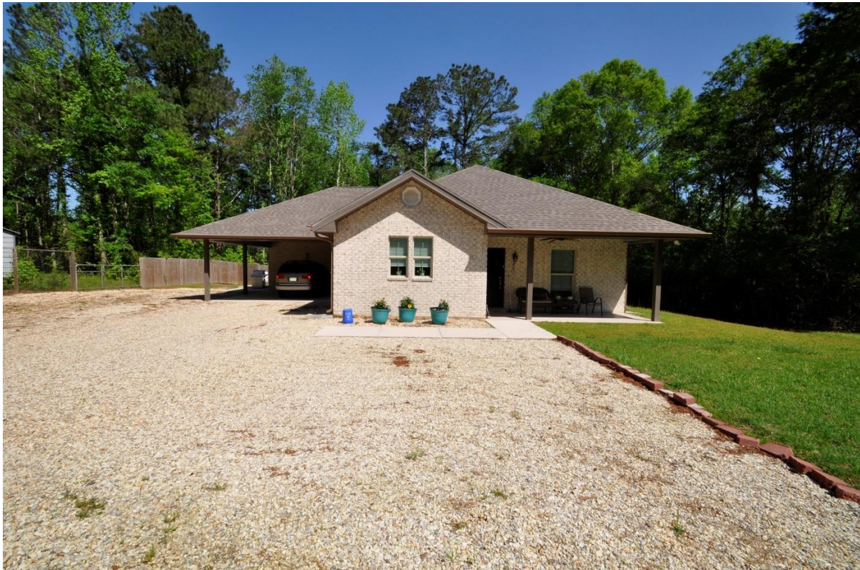
Front of Home

This home is managed by CENTURY 21 Eric Enterprises Inc, but is not necessarily CURRENTLY available for rent unless it appears on our AVAILABLE RENTAL list.