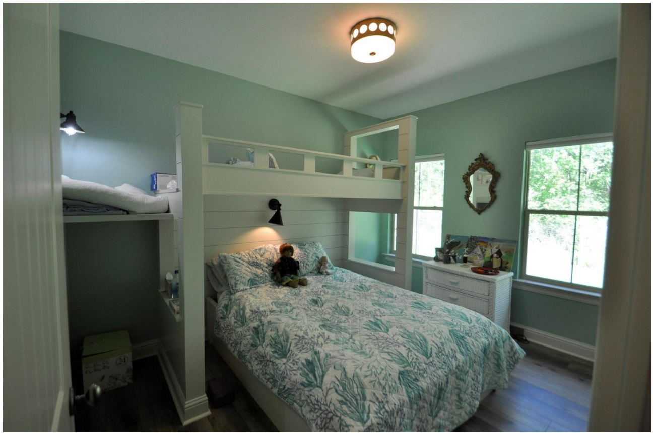
1 st Bedroom with built-in bed