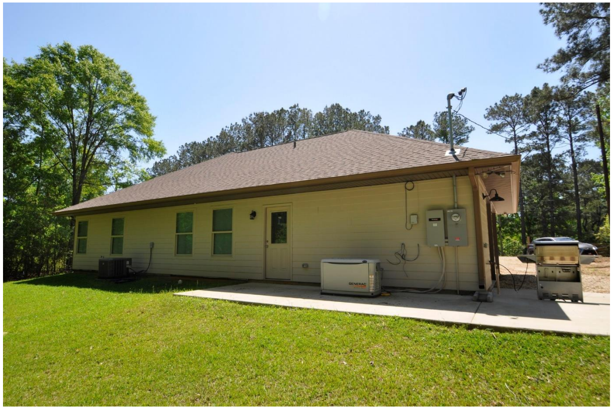
Back of home