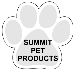
22in x 21in