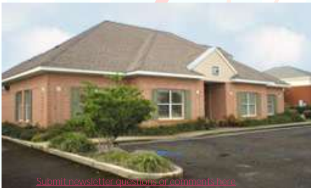
Submit newsletter questions or comments here